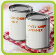
Sweetened creamer/ Condensed milk