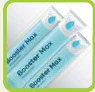
3in1 Sachet product