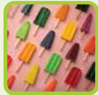
Sweetened frozen food